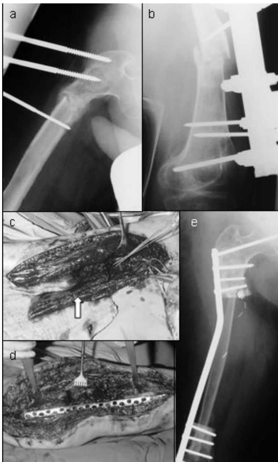
Figure 4 Case 4 chronic osteomyelitis and non union in Ewing's sarcoma A Preoperative conventional bone X-ray showing the inserted allograft with pseudarthrosis at the proximal and distal end 2 years after resection of the Ewing's sarcoma. B Preoperative X-ray showing the inserted allograft with pseudarthrosis. C Harvesting of the free fibular graft. D Placement of the fibular bone graft and fixation of the femur fragments with a plate E Postoperative bone X-ray 4 weeks after grafting the free fibula between the femur fragments