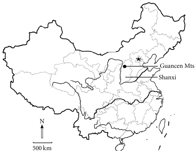
FIGURE 1: The location of the Guancen Mountains in Shanxi province of China (the coordinate system of this map was WGS 1984). The star is Beijing, the capital of China.

in this area [26–28]. However, no studies have examined the variations of vegetation and species diversity associated with the major environmental variables in the Guancen Mountains. Quantitative analysis of vegetation data, such as classification and ordination, is an important approach to generate and test hypotheses with respect to vegetation and environment [3, 29–33]. Therefore, the woodland plant species composition and diversity were analysed and their relationships with environmental variables were investigated in the present study. Our objectives were (1) to test the hypothesis of a maximum diversity at the intermediate altitudinal range, (2) to analyse the interdependencies among community characteristics and topographic variables, and (3) to identify the key environmental variable influencing plant community composition and species diversity.