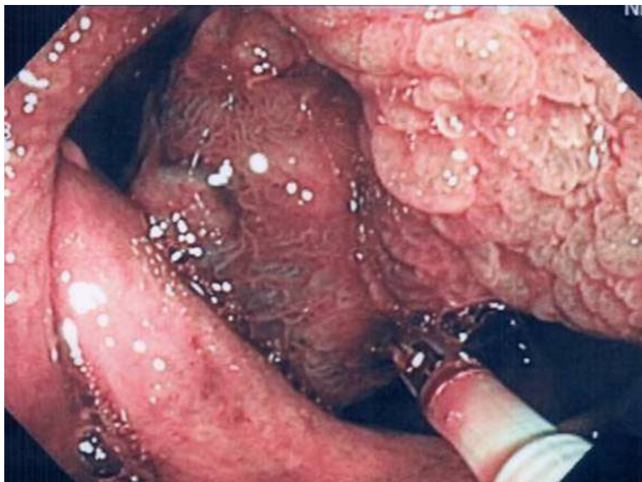
Figure 1 Endoscopic view. Colonoscopy showing a red, sessile and lobulated polyp in the cecum. A biopsy is performed.