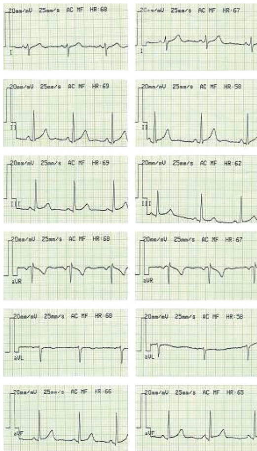
Fig. 1. Changes of heart rates in six limb leads in the Ylang-Ylang group. Left lines: Sample figures of six limb leads (from lead I to aVF) in the pre-test. Right lines: Sample figures of the same leads in the post-test. The heart rate is represented in the upper right end.