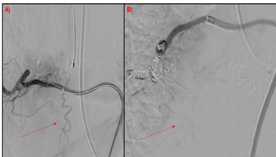
FIGURE 2: Spinal angiogram

The patient underwent embolization of the right T7 spinal artery was performed with obliteration of the fistula (Figure 2). The patient tolerated the procedure well without complication and was discharged home.