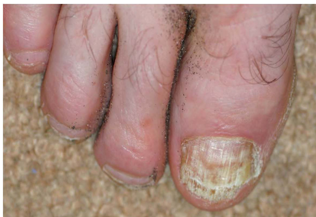
Figure 1 Photo 1 during a relapse 1994.

sible (i.e. no change found when a true difference exists). [7]