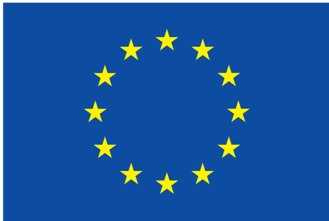
Figure 3 European Union emblem.

each level, hospital and survivor, as well as on an aggregated level.