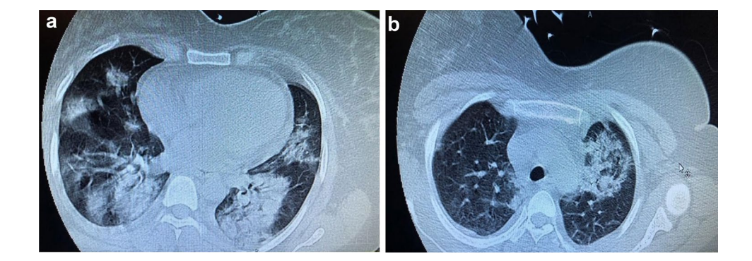
Fig. 3 Chest CT scans of a 32-year-old Iranian pregnant woman with COVID-19 at 36 weeks gestation at admission time ( a ), and 3 days after starting antibiotic-antiviral therapy ( b )

Li et al. [22] based on the typical image of CT confirmed that COVID-19 pneumonia could cause some abnormalities in both lungs of 15 out of 18 suspected patients. Chen et al. [34] detected multiple patchy GGO on chest CT scans of nine positive parturients with COVID-19, without any typical symptoms such as fever and dry cough. The chest CT scan of a 28-year-old pregnant at 30 weeks gestation showed subpleural patchy consolidation and ground-glass opacities in the left and right lung sides, respectively [29]. Chen et al. [19] after taking CT scans of a 27-year-old pregnant woman suspected to COVID-19 found that this viral infection could cause some patchy peripheral and subpleural ground-glass opacities in the left lower lung lobe, whereas a minor subpleural opacity with irregular blurred margins was observed in the right middle lobe. The chest CT imaging of three pregnant cases with COVID-19 was examined by Liu et al. [30]. Even though there was normal auscultation of the patient's lungs on their admission time, several typical and atypical CT manifestations as a result of the COVID-19 invasion were observed in terms of bilateral infiltrates, localized emphysema, subsolid patchy, GGO, and linear fibrotic patterns. They also signified that the lung abnormalities in two cases were progressed, while another patient