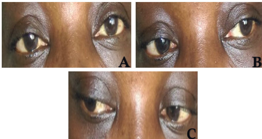
FIGURE 3: (a) Regression of right ptosis. (b) Complete remission of the third cranial nerve. (c) Complete remission of the sixth cranial nerve.