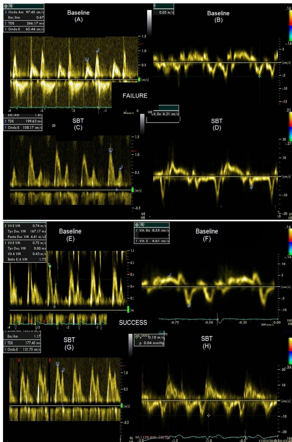
Figure 2 Doppler figure with E/Ea measurement at baseline and during SBT in success and failure. (A) Represents tissue Doppler of mitral annulus at baseline, amplitude of early diastolic wave Ea is 5 cm/sec, the resultant E/Ea ratio is 13. (B) E increases during SBT to 108 cm/sec. (C) Ea is 6.2 cm/sec, the resultant E/Ea increases during SBT to 17.4. (D) Represents pulsed Doppler of mitral flow at baseline in a patient who succeeded, E is 74 cm/sec. (E) Ea is 8.5 cm/sec, the resultant E/Ea is 8.7. (F) E increases during SBT to 121 cm/sec. (G) In the same way Ea increases to 10 cm/sec, then E/Ea ratio remains low during SBT at 12.1.