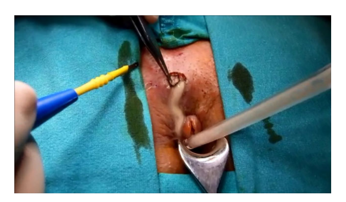
Figure 3: The abscess was drained with appropriate unroofing.