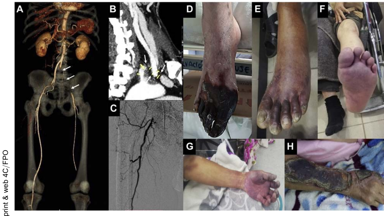
Fig. 1. (A) CT angiography with three-dimensional reconstruction showing an intraluminal thrombus affecting the common, external, and left internal iliac arteries with distal recanalization (Arrows). (B) CT angiography showing a thrombosis at the level of the origin of

the left subclavian artery (Arrow). (C) Arteriography with occlusion of the common and superficial right femoral artery. (D–H) Various clinical manifestations of ALI in patients infected by COVID-19.