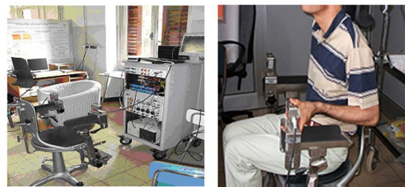
Figure 1 The load cell. Illustration of the load cell used for the hand grip muscle strength measurements used in the study.

Data from 2 patients, both males aged between 30 and 40 years, were obtained. Both patients had a muscle disorder