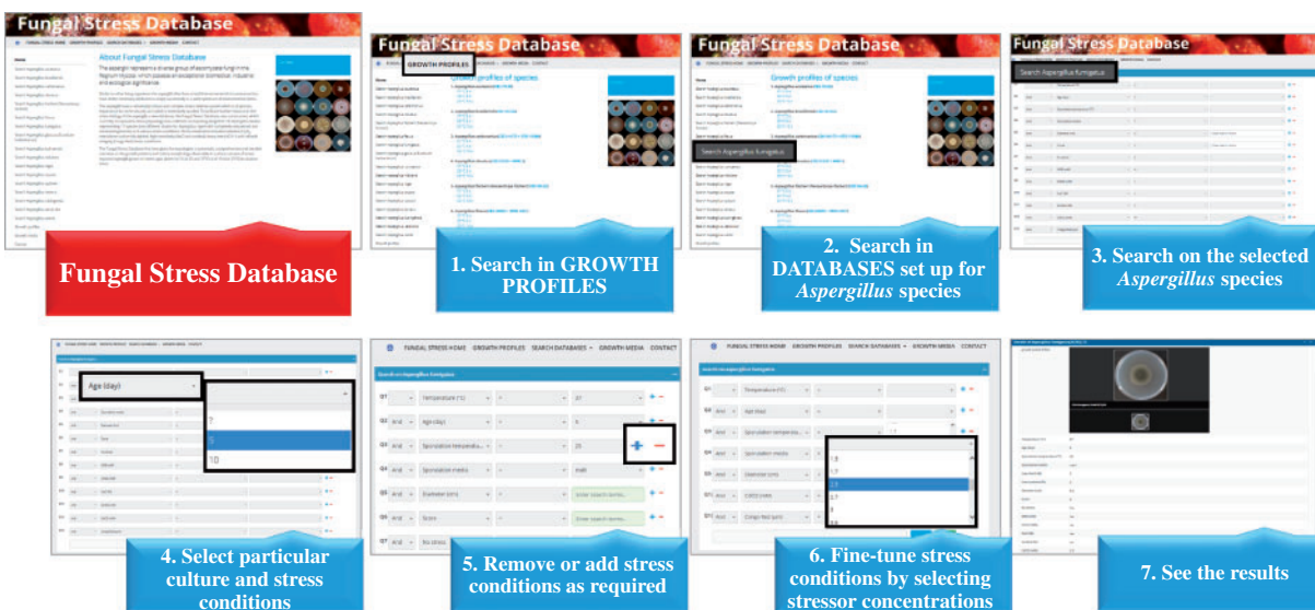
Figure 3. Search in the FSD.

which will make any direct comparison of the stress tolerances of these strains quite easy.