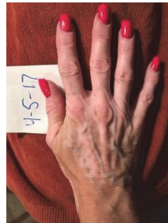
FIGURE 3: Clinical appearance of the right dorsal hand 13 months after using apremilast 30 mg twice daily.