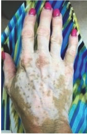
FIGURE 1: Clinical appearance of the right dorsal hand 5 and a half months after beginning apremilast.