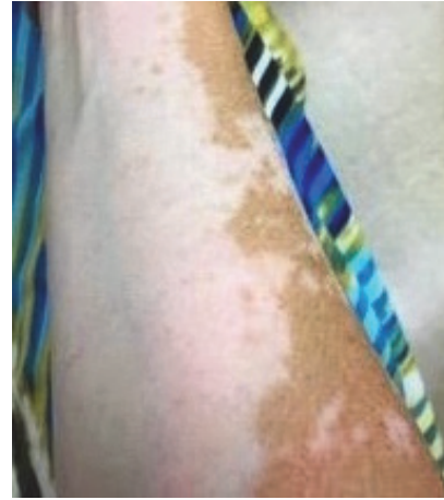
FIGURE 2: Clinical appearance of the right anterior forearm 5 and a half months after beginning apremilast.