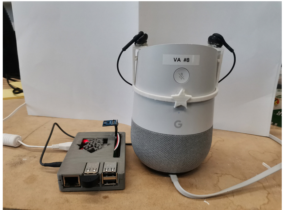
Fig. 1 A proactive Google Home assistant. We attached earphones to the speaker, which deliver inaudible sound bites for activating the device and invoking custom applications, such as triggering a health survey or invoking a medication reminder.