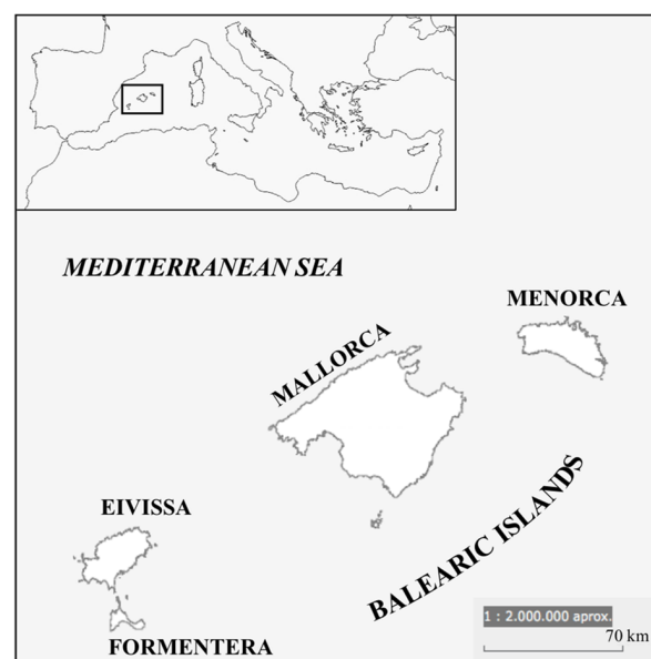
Figure 1. Map of the study area in the Balearic Islands. Names of the four principal islands are written in bold. Inset box indicates the location of the Balearic Islands in the western Mediterranean Sea.