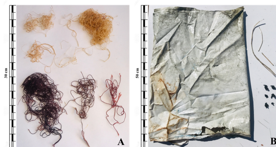
Figure 2. Examples of plastic debris recovered from cetaceans in the Balearic Islands. (A) Fishing rope items encountered in the stomach of a necropsied female adult of T. truncatus (TL: 3.1 m); (B) white plastic bag and plastic packing strap fragments collected from the stomach of a necropsied P. macrocephalus (TL: 5.4 m).

(plastic bag). Among the total samples analysed, the most frequently observed plastic shape was thread-like (70%), followed by sheet-like (30%). The dominant colour category of plastic items recovered was white–transparent ( n = 6 ), followed by dark ( n = 3 ), then light ( n = 1 ). All plastic items were included in macroplastics category, and no mesoplastics or microplastics were found. Out of the 27 cetaceans that were found without ingested marine litter, 12 of them presented a totally empty digestive tract; although in 15 specimens, food remains such as fish bones and squid fragments were observed. Moreover, the three specimens that ingested litter showed prey remains (Table 1).