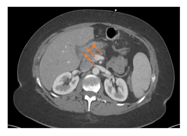
Fig. 1. CT abdomen, axial plane. Free fluid (arrows), no signs of free air.