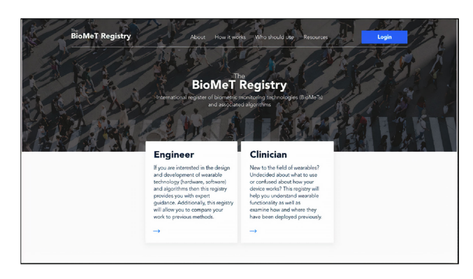
FIGURE 1. Framework title page. Tailored experience to (i) engineer (or data scientist) and (ii) clinician (healthcare professional), This dual engagement is a key feature to ensure widespread applicability to multidisciplinary users.

The proposed conceptual evaluation framework (design) details a digital interaction experience specifically tailored for differing professions who design/develop/create or use BioMeTs and/or their algorithms, i.e. engineers or data scientists and healthcare professionals, respectively (Fig. 1). Here, the framework is named the BioMeT Registry (Fig. 1 and 2) to highlight an objective, i.e. documentation of technical specifications.