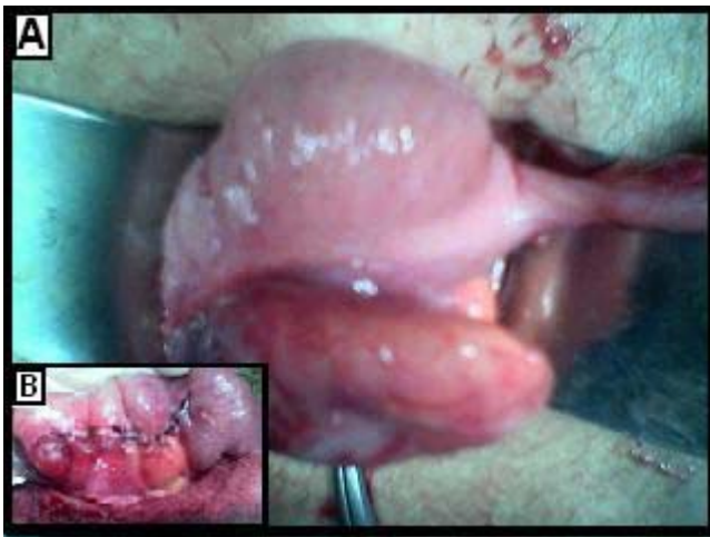
Figure 1 A: Intraoperative view. B: Postoperative view.