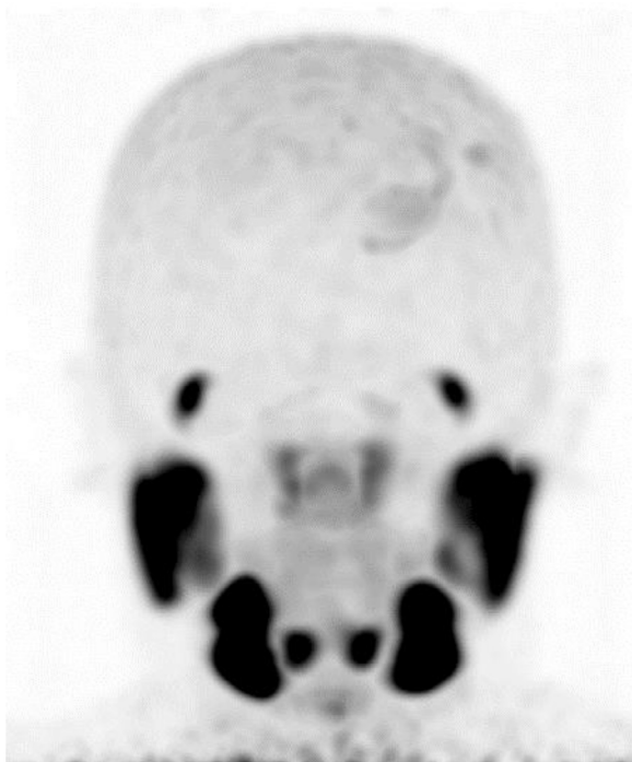
Fig. 1 – Maximum intensity projection images with [^{68}\text{Ga}]\text{Ga-PSMA-11} PET revealed a low and homogeneous uptake surrounding the lesion, and a focal mild uptake near to the glioblastoma.

pressed in prostate adenocarcinomas. It is also overexpressed by the endothelium of tumor-associated neovasculature such as glioblastomas multiform, but neither in malignant tumor cells themselves nor in normal vessels. A few articles have