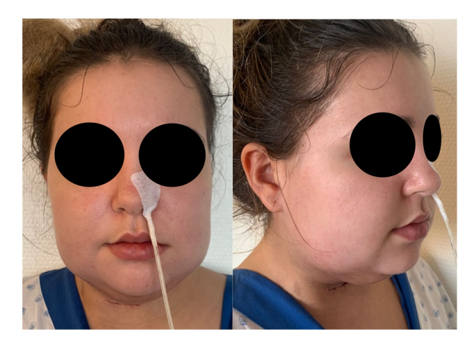
Figure 4. Six weeks postop.