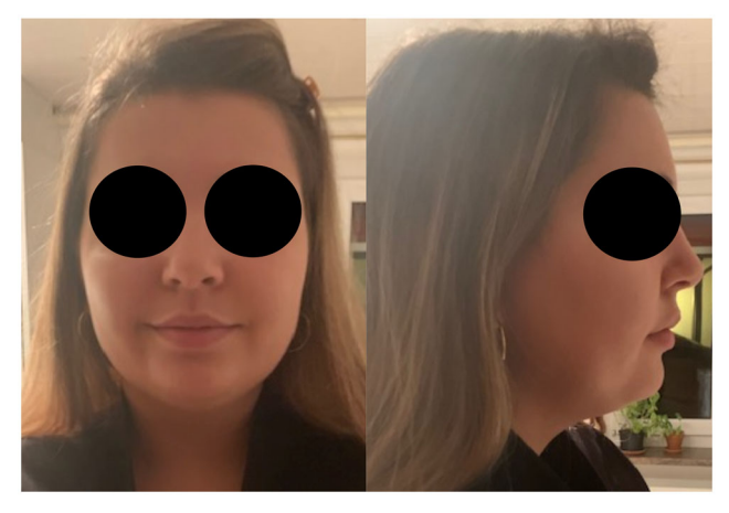
Figure 1. Pre-operative status.

to the intensive care unit for respiratory surveillance. On POD4, she develops stridor with progressively worsening edema and is therefore intubated; repeat CT scan remains unchanged. On POD6, surgical exploration at the base of the neck reveals diffuse