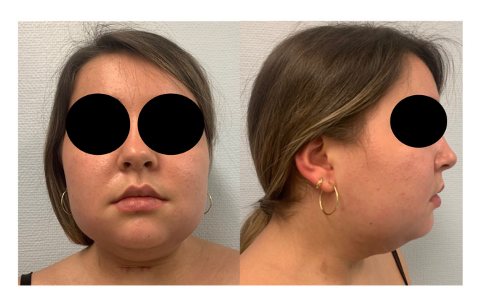
Figure 5. Three months postop.

three months postop, despite daily massage and intermittent compression garments, significant soft tissue hardening and contour deformity persist, associated with bilateral marginal mandibular nerve palsy, submental hypesthesia and dysphonia due to prolonged intubation (Figure 5).