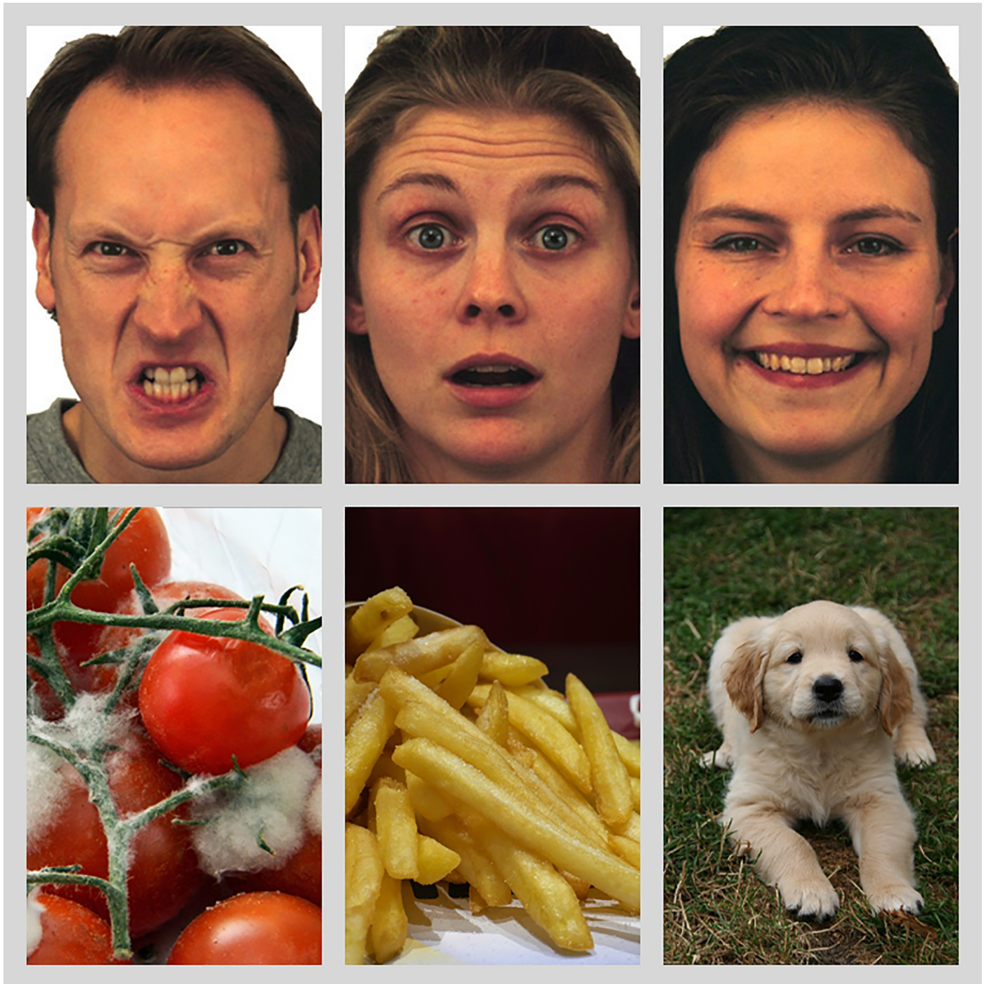
Fig 1. Negative, ambiguous, and positive images. Examples of clearly valenced and ambiguous images are shown. The selected faces come from the KDEF stimulus set and feature AF06HAS, AM10ANS, and AF30SUS. The additional scenes represent the types of IAPS stimuli used in our current study.

https://doi.org/10.1371/journal.pone.0225106.g001