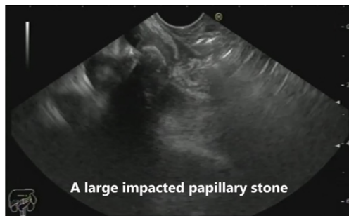
DOI: 10.4253/wjge.v14.i9.564 Copyright ©The Author(s) 2022.