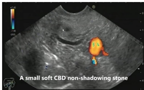
DOI: 10.4253/wjge.v14.i9.564 Copyright ©The Author(s) 2022.