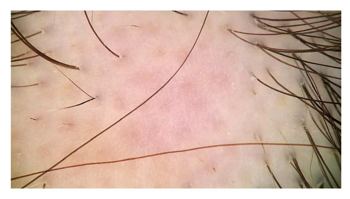
Fig. 3. Macroscopic picture of the scalp lesions.

Skafida et al.: Scalp Metastasis Mimicking Alopecia Areata following Breast Cancer