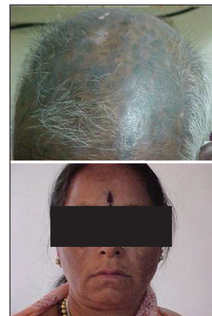
Figure 2: Hyperpigmentation on the skull and face (imatinib side effects)

Cytogenetics response was seen in very few patients as most of them refused the test and seeing their limited resources, we also did not force it. Moreover, even if the patient had poor cytogenetic response we did not have much to offer them and patients were not able to afford dasatinib or bone marrow transplantation. Two patients who took dasatinib post AP showed poor tolerability and ultimately succumbed to the disease.