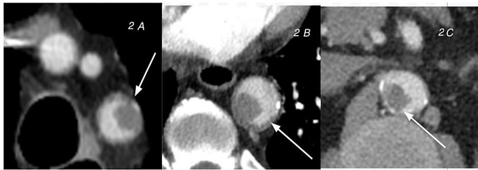
FIGURE 2: Case 2. CT angiography per the pulmonary embolism protocol shows free-floating thrombosis in the arch (A), descending aorta (B), and abdominal aorta (C).