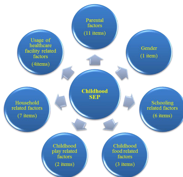
Figure 2. Domains of childhood socioeconomic position.

The textual analysis of the transcripts of in-depth interview extracted a list of 42 items. These 42 items were