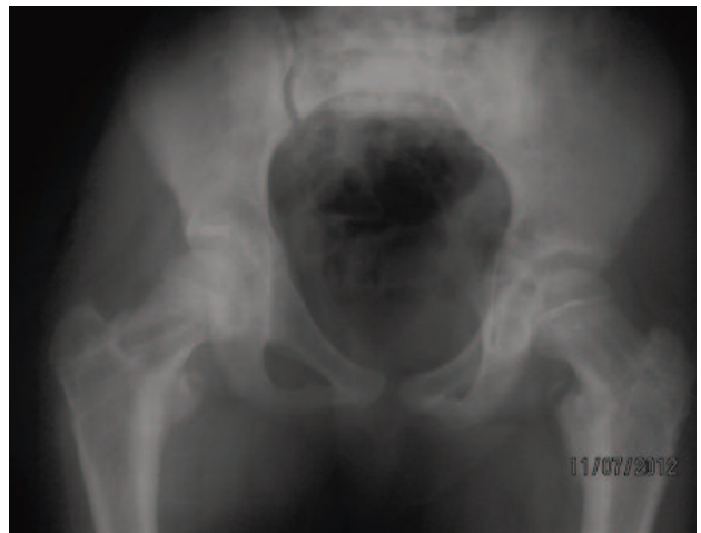
Fig. 4: Anteroposterior radiograph of pelvis immediately after cancellous screw removal.

together with hip decompression. Operative fixation should be carried out preferably within 48 hours of fracture. Our case was operated on 40 hours after admission after optimization of her general condition and this is consistent with accepted guidelines. Other complications which can occur are non-union, coxa vara, coxa valga, leg length discrepancy, arthritic changes and premature closure of proximal femoral epiphysis 1 . Our patient did not have any of these complications.