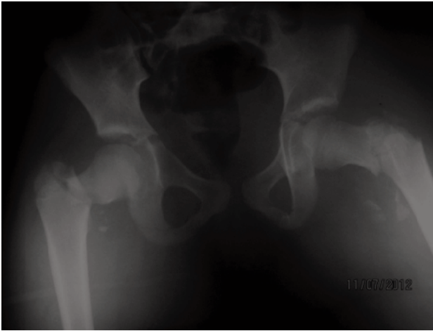
Fig. 1: Anteroposterior radiograph of pelvis showing bilateral displaced fracture neck femur.