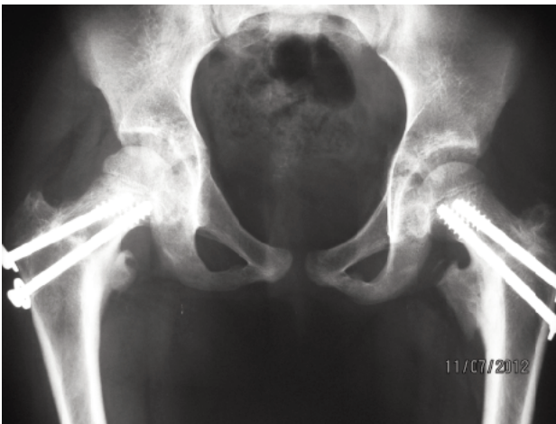
Fig. 3: Anteroposterior radiograph of pelvis showing both fracture neck femur healed with implants in situ.