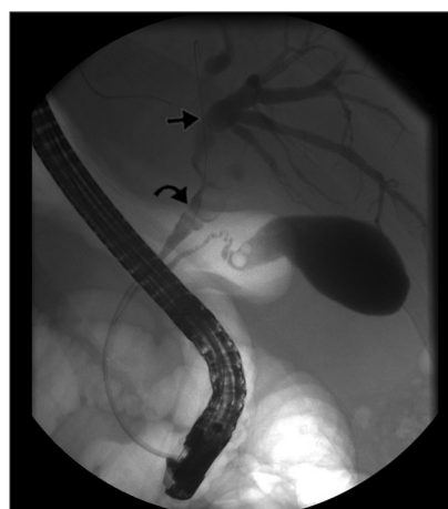
Figure 2. Endoscopic retrograde cholangiopancreatography showing contrast within dilated biliary tree (solid arrow) and daughter cyst within proximal hepatic duct (curved arrow)