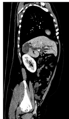
Figure 1. Curved reformatted computed tomography with intravenous contrast showing the hydatid cyst (arrow head) communicating with the dilated biliary tree (curved arrow) and dense material in the proximal hepatic duct indicating the daughter cyst (solid arrow)