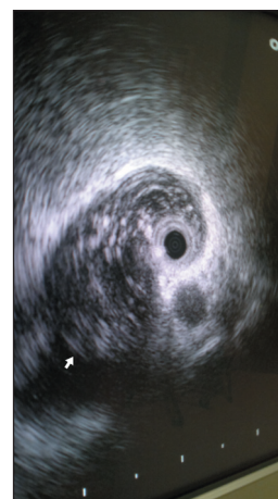
Figure 3. Intraductal ultrasound revealed a hyperechoic filling defect most consistent with hydatid disease and not infiltrating tumor thus ruling out cholangiocarcinoma