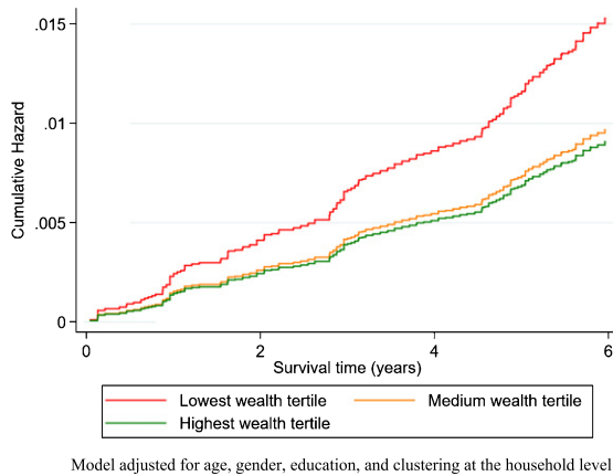
Fig. 2. The cumulative hazard of dementia over time in study by wealth tertiles.