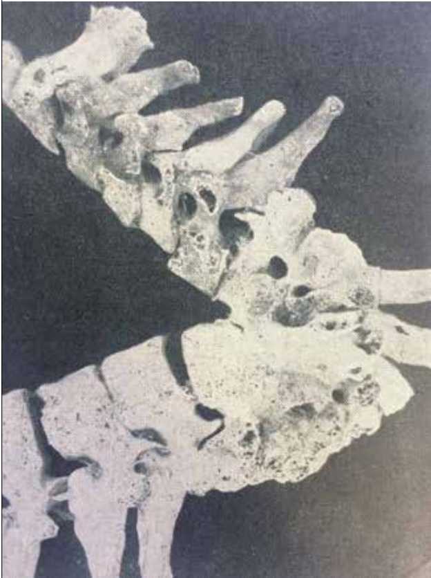
Fig. 1. Human spine deformed by tuberculosis, Leipalingis, Lithuania, 14-15 th century.

specialized dispensaries, information of the population, especially the patients' next of kin, their education, the need to register all TB cases because the statistical information was necessary [15, 16].