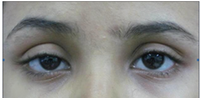
Figure 1: Clinical photograph showing mild ptosis in the right eye

The common postoperative complications following excision of a vagal nerve schwannoma are injury to the nerve, hoarseness of voice, and vocal cord palsy.