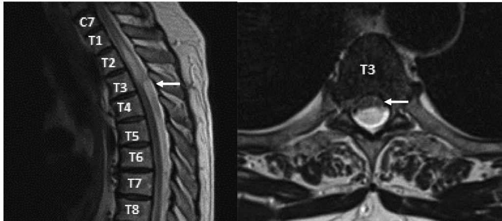
Fig. 2 – MRI-T2 weighted imaging with a sagittal view of the thoracic spine (Left), and an axial view at the level between the T3 and T4 vertebrae (Right). On the sagittal image on the left, note the sharp indentation of the spinal cord ventrally (indicated by the arrow) with an associated syrinx superior to this. On the axial image on the right, note the significant ventral displacement and flattening of the spinal cord as indicated by the arrow. This is a clearer example of the “Scalpel Sign”. This patient was found at surgery to have a dorsal thoracic arachnoid cyst.