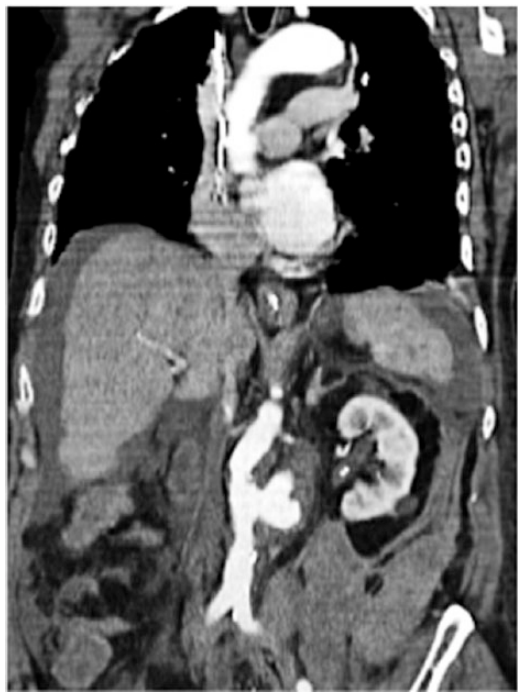
Figure 2. A mycotic abdominal aortic aneurysm.

The last column "HIV-related aneurysm" was added by the authors of this article.