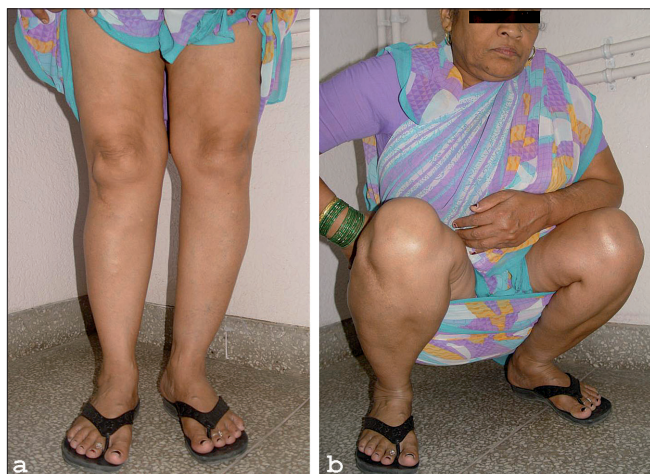
Figure 4: Clinical and functional result of the HTO done on right knee, 6 years after operation