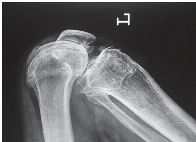
Figure 3: This patient was operated at 64 years of age. Now at 73 years of age, 9 years after HTO the patient has full range of knee flexion

(2 points for easy; 1 point, difficult; 0 points, impossible in each item)