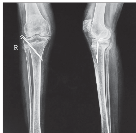
Figure 2: X-rays soon after HTO showing K wires and lateral and posterior ledges from the proximal segment. Note slight anterior positioning of tibial tubercle from the distal fragment

millimeters. Having obtained the desired correction of 7° valgus and 5° of external rotation, two Kirschner's (K) wires (usually 2-mm thick) are passed from the superolateral part of tibia crossing the site of osteotomy to engage the medial cortex of the distal fragment for further stability [Figure 2]. The bones harvested during the operation are used as bone grafts and packed around the site of osteotomy. The wound is closed in layers over a suction drain. The limb is put in a plaster cast from mid-thigh to the ankle.