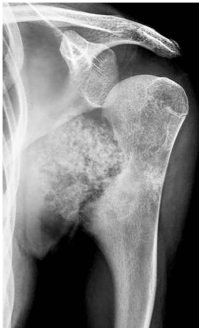
Fig. 2 X-ray of secondary chondrosarcoma developing in a prior osteochondroma of the proximal humerus.

than 1%. However, in multiple osteochondromatosis the risk increases to 5%, though they usually present after skeletal maturity. In 2012, Mosier et al published the only reported case in the literature of a chondrosarcoma possibly arising secondary to an enchondroma in a paediatric patient. 12 Subsequently in 2016, the series of 17 patients of paediatric chondrosarcomas by Gambarotti et al included a case developing in a metacarpal in a patient with Maffucci's syndrome. 3 Patients with Ollier disease and Maffucci's syndrome may have up to a 40% risk of developing chondrosarcoma. 13