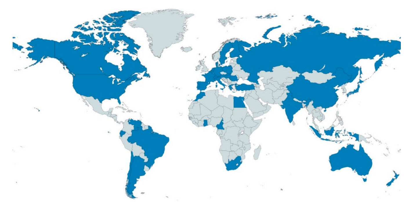
Figure 1. Geographical distribution of Torulaspora delbrueckii . Countries in which T. delbrueckii isolation was reported are highlighted in blue. Data were collected from Albertin et al. [6], Drumonde-Neves et al. [1] and de Vuyst et al. [17].

Yeasts from the genus Torulaspora have been reported in a wide variety of habitats, such as fruits [6], insects [7,8], soils [9], soil invertebrates [10], plants [11,12], seawater [13], spoiled food [6] and malt environments [6], where yeast from other genera like Saccharomyces and Zygosaccharomyces may also be present [14,15]. Although not considered a human pathogen, the species T. delbrueckii can also be found as a clinical isolate [16]. In addition to the diversified isolation substrates, T. delbrueckii also presents a worldwide geographical distribution, with reports describing its isolation in 37 countries from the five continents, as shown in Figure 1