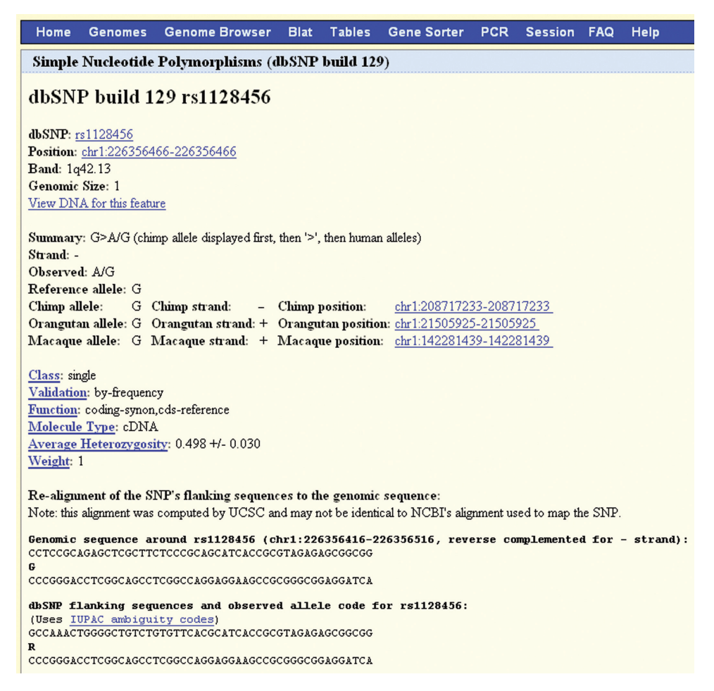
Figure 1. SNP 129 track details page showing partial information about SNP rs1128456 on chromosome 1.

found on the corresponding Genome Browser track details pages.