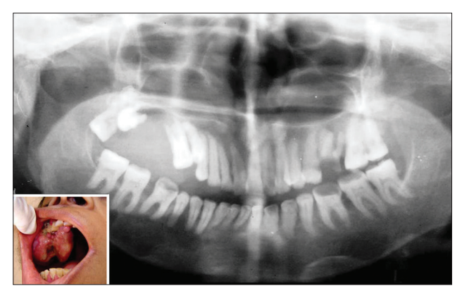
Figure 2: Intraoral photograph revealing a growth extending buccally and palataly i.r.t 12-18 region (inset) and orthopantomograph showing resorption of right maxillary alveolar region with multiple cyst-like radiolucent areas in right side of body of the mandible

A 38-year-old female complained of swelling in anterior maxillary region since 2 months. She gave history of