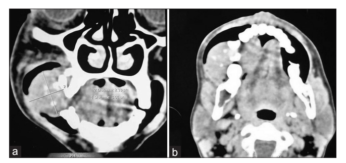
Figure 3: Computed tomography scan showing: (a) destruction of the alveolar bone in right maxilla and lytic lesion involving the left body of mandible and; (b) lytic lesion involving the left body of mandible