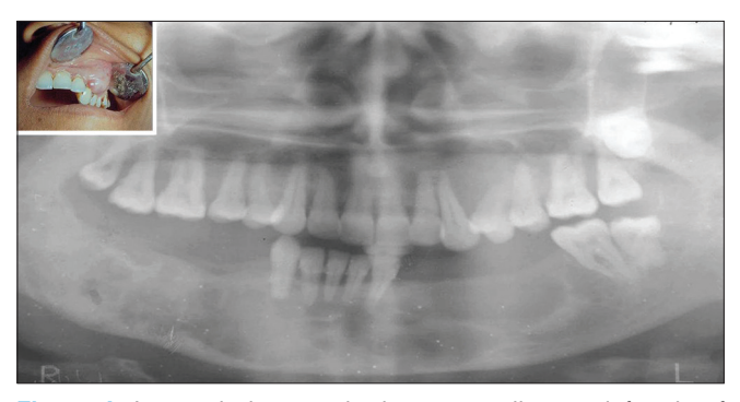
Figure 4: Intraoral photograph showing swelling on left side of maxilla (inset) and orthopantomograph showing resorption of left posterior maxillary alveolar region with multiple, radiolucent, cyst-like lesions involving whole of the body of mandible