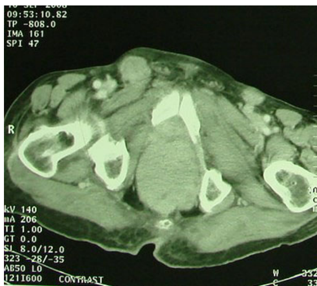
Figure 3 Pelvic computed tomography scan performed before chemotherapy treatment shows the Bulky anorectal process (see arrows).

The standard criteria for the diagnosis of primary intestinal lymphomas were established by Dawson et al [4].