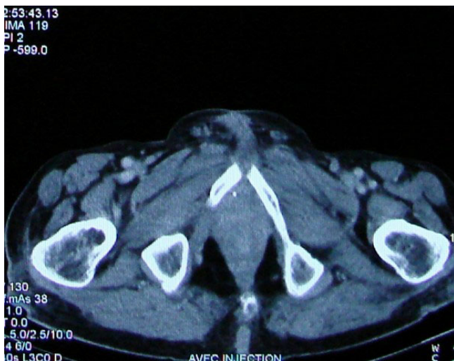
Figure 5 Pelvic computed tomography scan performed after the end of chemotherapy shows complete radiological response of the ano-rectal tumour.

Tumours were considered to be primary on the following grounds: 1. The patient at first dose not present palpable superficial lymphadenopathy; 2. Chest radiographs showed no obvious enlargement of the mediastinal nodes; 3. The white blood cell counts, total and differential, were within normal limits; 4. At laparotomy the bowel lesion predominated, the only lymph nodes, obvi-