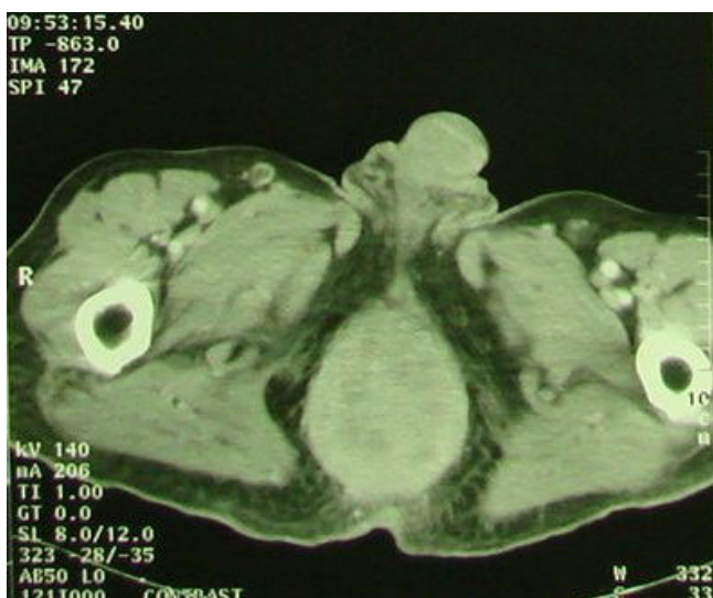
Figure 4 Pelvic computed tomography scan performed before chemotherapy treatment shows the Bulky anorectal process with enlarged lymph nodes in the inguinal areas (see arrows).

Tumours were considered to be primary on the following grounds: 1. The patient at first dose not present palpable superficial lymphadenopathy; 2. Chest radiographs showed no obvious enlargement of the mediastinal nodes; 3. The white blood cell counts, total and differential, were within normal limits; 4. At laparotomy the bowel lesion predominated, the only lymph nodes, obvi-