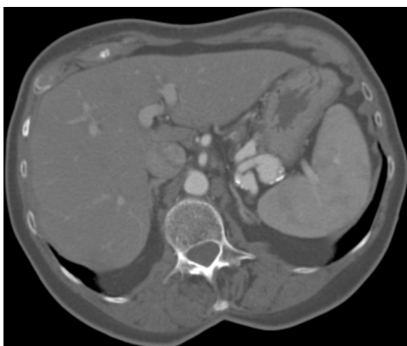
Fig. 2. CT-scan of the abdomen showing a 3.1 cm diameter, para-hilar aneurysm of the splenic artery, surgically resected after a failing attempt at trans-catheter coil embolization.

for other associated diseases. After discussing the possibility of an iterative endovascular attempt via the humeral artery, the final decision was to perform surgical resection of the aneurysm and the patient gave her informed consent. Resection of the aneurysm and splenectomy were performed by the senior author (GI) through a left subcostal access and were followed by a regular, 5-days long postoperative course (Fig. 3).