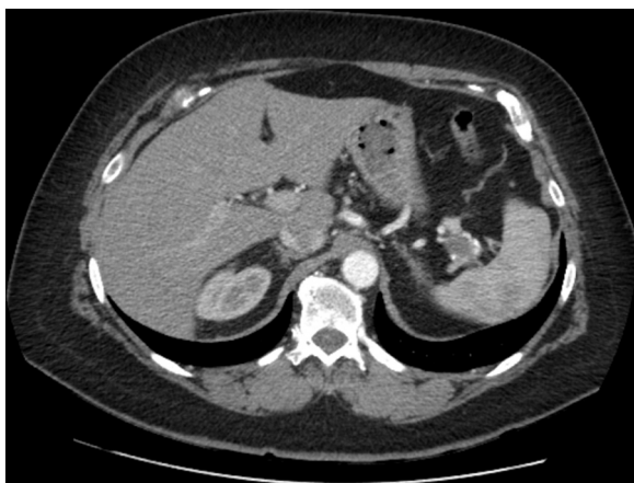
Fig. 1. CT-scan of the abdomen showing a 2.0 cm diameter aneurysm of the splenic artery at the hilum of the spleen.