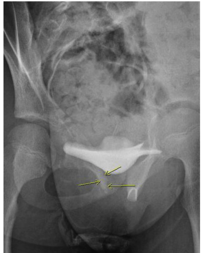
Figure 3. Oblique IVP reveals insertion of the ectopic ureter into the vaginal cavity in Patient B (arrows).

Ectopic ureters are believed to result from the early splitting of the ureteric bud during embryonic development. The ureteral orifice is subsequently located in a more caudal position either at