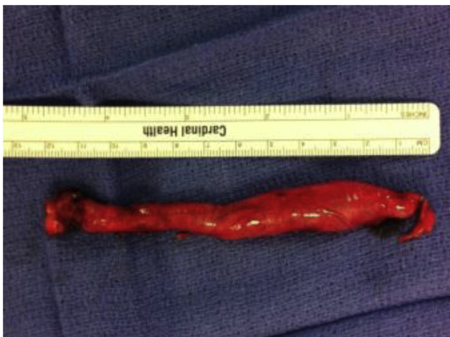
Figure 2. Patient A's dilated left upper pole ureter (12 cm). The ureter is serially sectioned to reveal a dilated lumen (0.7 cm).