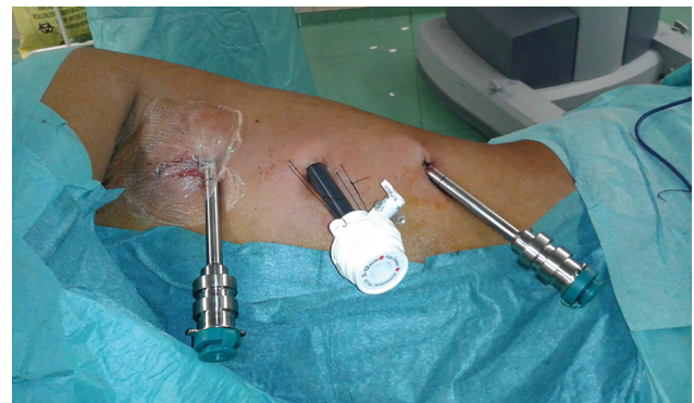
Fig. 2. The first port was placed at the inferior aspect of the axillary incision. A 1-cm incision was performed at the second port marking, and a 12-mm port was blindly inserted with a finger protecting the chest wall through the axillary incision. The 30-degree endoscope was then placed through the second port, and the third 8-mm port was introduced through a 5-mm incision under endoscopic vision.

An 8-mm incision was performed at the second port mark, and an 11-mm port was blindly inserted with a finger protecting the chest wall through the axillary incision. The 30-degree endoscope was then placed through the second port, and the third 8-mm port was introduced through a 5-mm incision under endoscopic vision (Fig. 2). Finally, the axillary incision was closed around an 8-mm port. The 3 ports were made airtight using either a purse-string suture or a Tegaderm (3M, Saint Paul, MN, USA).