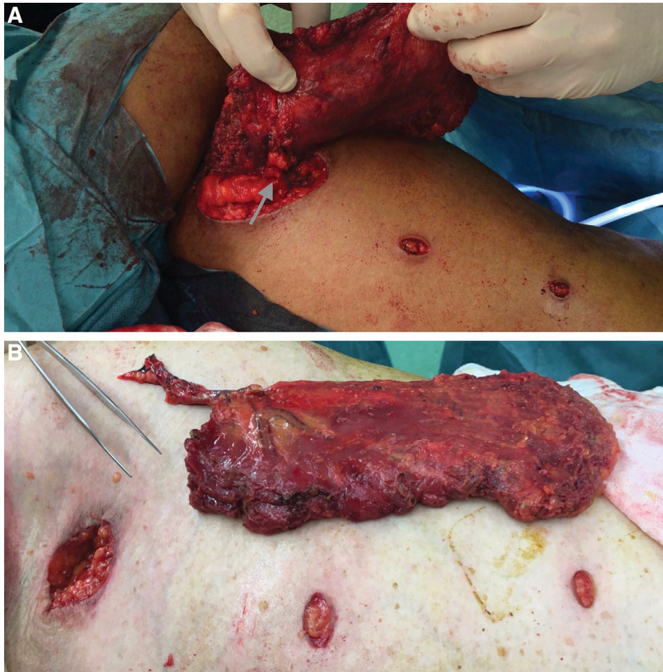
Fig. 4. After the muscle was released from the inferoposterior borders and from the tip of the scapula, the robot was undocked, and the axillary incision was reopened to enable pedicle dissection and the tendon release under direct vision. A, Pedicle is indicated with the gray arrow. B, LDMF after pedicle and tendon release.

and those related to the difficulty working in multiple quadrants, but even with the Xi, LD pedicle dissection cannot be performed due to the lack of triangulation when directed cranially toward the axilla. Nevertheless, the Da Vinci Xi provides standardized 8-mm ports for all instruments, and the camera fits in each port and has the ability to automatically rotate while circumventing the thorax curvature. We performed 2 LDMFs with the Xi, and these new features simplified the dissections and decreased time of surgery. (See Video [online], which displays that Da Vinci Xi has the ability to automatically rotate to ease the circumvention of the thorax curvature and solve instruments' conflicts within the optical window. It simplified the dissections and decreased time of surgery.)