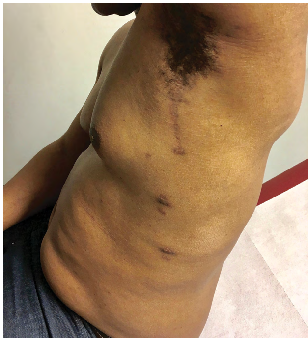
Fig. 5. Postoperative scars from the 5-cm axillary crease incision along the posterior axillary fold and from the two 1-cm incisions used for robotic access.

instruments, raising the LDMF is a multi-quadrant surgery. It requires large amplitude movements from the robotic arms that are facilitated by a greater distance between the entry sites.