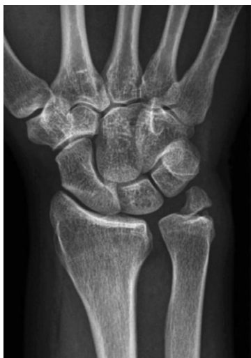
Figure 2. USP non-union 11 years after distal radius fracture.

deformity in the radius was found in 32%, slight deformity ( < 15^\circ ) in 30% and no deformity in 37%. Anterior-posterior displacement of the radius was \geq 2 mm in 26% and 0–2 mm in 6%, while coronal plane displacement ( \geq 2 mm or 0–2 mm) was found in 8% and 4%, respectively. 3% of the fractures were comminuted.