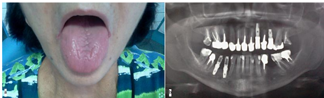
Fig. 1. a Mouth aspect at first clinical presentation. Note the severe atrophic tongue and bilateral angular cheilitis. b Panoramic radiograph taken at first clinical presentation. Note periapical lesions, caries and generalized bone loss.