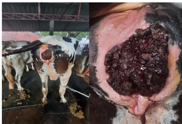
Fig. 1: Large dark red irregular solid mass protruding from the vulva of a pregnant Holstein Friesian cross-breed cow

All procedures performed are in accordance with the ethical standards of the institution at which the studies were conducted. A seven-year-old, three months pregnant Holstein Friesian cross-breed cow was presented with a history of a large tumor mass protruding through the vulva for the past month (Fig. 1). The tumor mass was friable on the exposed side and firm towards the inner aspect. It was dark red and had an irregular surface with diffuse ecchymotic hemorrhages. In addition, the vulva and perineum appeared enlarged and prominent. The owner reported that the tumorous growth was initially observed as a small wound in the vulva that later transformed to a larger mass. The feeding history, temperature, respiration rate, pulse rate, and mucous membranes of the animal were normal at presentation. However, the vestibular and vaginal lumen was found to be narrow during the digital examination due to the large tumorous mass compressing the vaginal wall.