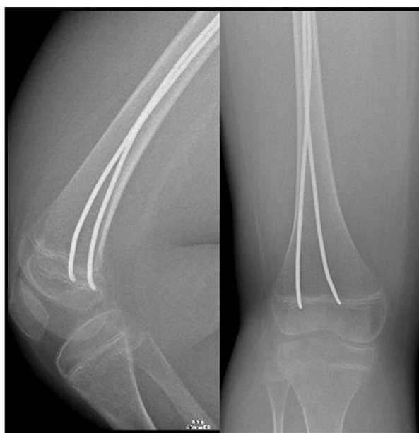
Figure 7. Radiographs of patient B, 1 year after surgery.

osteoporosis is most profound in the lower extremities and begins to develop early while still ambulating [7]. The bone mineral density in the proximal femur was reported to be considerably diminished even when gait was minimally affected; then it progressively decreased to nearly 4 standard deviations below the age-matched normal [7]. Calcium and vitamin D or alendronate administration are investigational treatments to improve bone mineral density, and eventually to reduce the fracture risk [9–11].