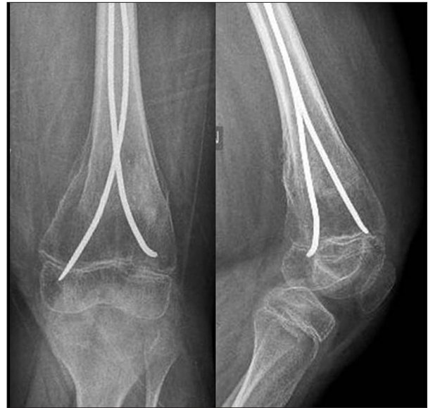
Figure 4. Radiographs of patient A, 18 months after surgery.

The surgery was performed in both cases in the supine position, under general anesthesia without the use of a traction table. An image intensifier was used. The FIN [3] was realized in a descending construct with the 2 nails entering the medullary cavity from the lateral cortex below the greater trochanter. The first nail was advanced up to the fracture site, then the second nail was inserted and advanced. Once the 2 nails were ready to overpass the fracture symmetrically (each pointing to 1 condyle), reduction was achieved by closed maneuvers (mostly extension of the knee) and the nails were pushed across the