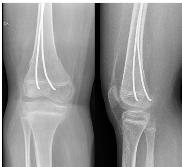
Figure 6. Postoperative radiographs of patient B: achieved reduction in the angulation of flexion.

The fractures are generally due to low-energy trauma, more commonly falls [2] acting on an osteoporotic bone. The falls from wheelchairs or a standing position are facilitated by muscle weakness, joint contractures, and a reduced sitting or standing balance [8]. The side effects of long-term corticosteroids, reduced weight-bearing exercises, reduced exposure to sunlight, and direct pathological effects of the myopathy are among the major risk factors for osteoporosis in DMD [1]. The