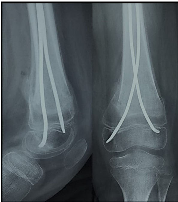
Figure 3. Radiographs of patient A, 2 months after surgery: complete consolidation with normal alignment.