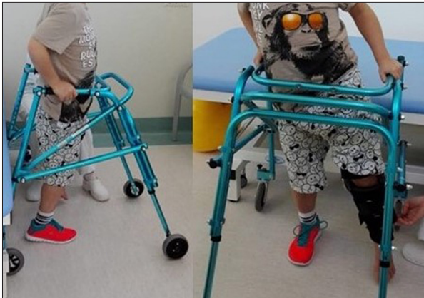
Figure 2. Patient A, 1 week after surgery: standing position achieved with walker support, a knee immobilizer, and no weight-bearing on the operated limb.