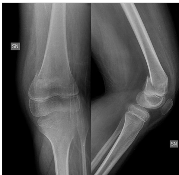
Figure 1. Preoperative radiographs of patient A: Age 12.8 years, able to walk without support for short distances before the fracture.

The 2 DMD patients were 12.8 years old (patient A) and 11.7 years (patient B) old at the time of the fractures. No other information is available on these patients' medical and family