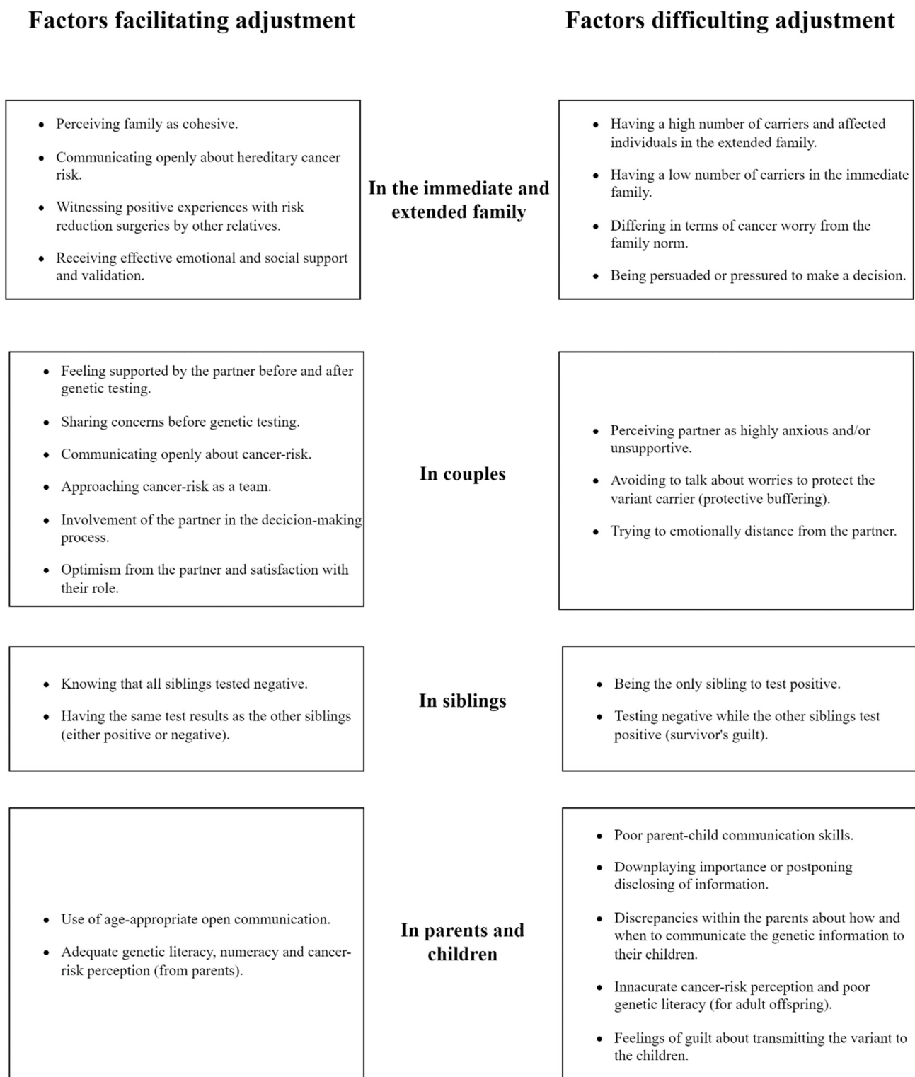
Figure 2. Summary of the factors affecting family adjustment to hereditary cancer syndromes.