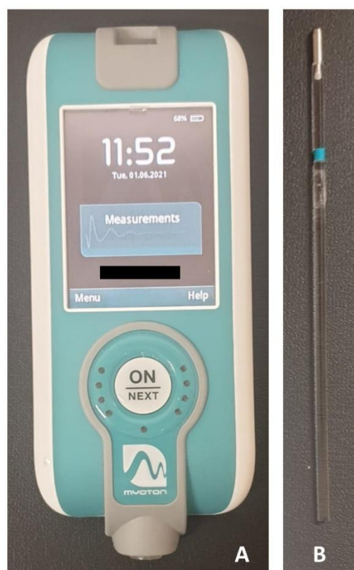
Figure 2. MyotonPro ® device (A) and 100 mm long probe (B).

The probe exerts mechanical impulses, with a pulse of 15 ms and 0.40 N of mechanical force, to record the tissue response. The average value of three mechanical pulses was used for the analysis. To reduce the abdominal influence on the test, the recording was performed during five seconds of apnea after exhalation [36]. A randomization online tool ( www.randomization.com , accessed on 20 February 2019) was used to establish the order of the evaluations (right/left). At the time of each assessment, the assessor was blinded to the previous measurement values.